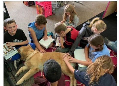
MAPLE and students at an elementary school