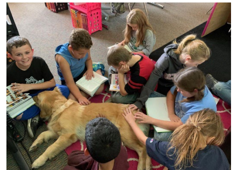
MAPLE and students at an elementary school